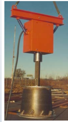
Electric Driven Centrifuge. (Can be automated)