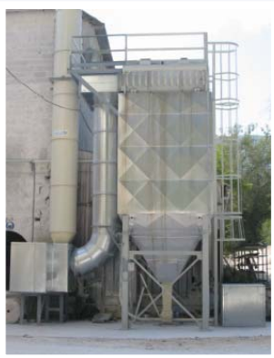
Dust Fume Filter from Galvanizing Furnace