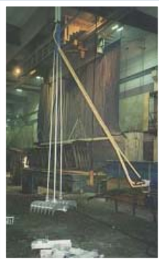
Pick up Grab