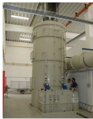
Scrubber for Pre-Treatment Fumes